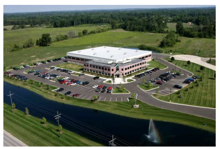
BTI World Headquarters. All our equipment is engineered & manufactured in the USA.

Headquartered near Ann Arbor, Michigan (USA), Balance Technology Inc BTI is a thriving Precision Measurement and Testing company with a strong domestic and international presence. Since 1968, BTI has set the standard in industrial Precision Measurement & Testing systems. With 13,000 plus systems shipped worldwide, our team approach to customer satisfaction and technical innovations has forged our reputation as an industry leader and trusted partner.